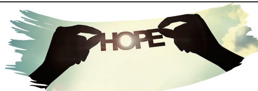
"Nourishing Hope" SSVP Retreat

There are still spots available for the 2024/25 school year for preschool children ages 2.5 to 5 years old at Angels Academy inside Our Lady of Lourdes School. Anyone interested can email them at angelsacademy@cisnd.ca